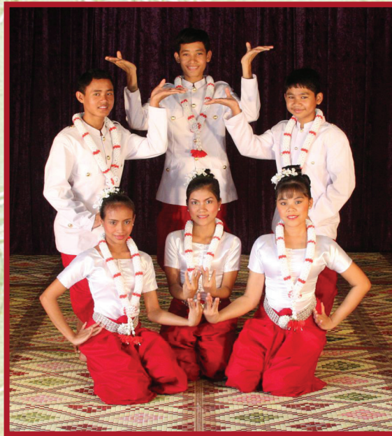
Garlands Instead of Ashes Isaiah 61:1-3

"Vindicate the weak and fatherless. Do justice to the afflicted and destitute. Rescue the weak and needy. Deliver them out of the hand of the wicked." Psalm 82:3-4