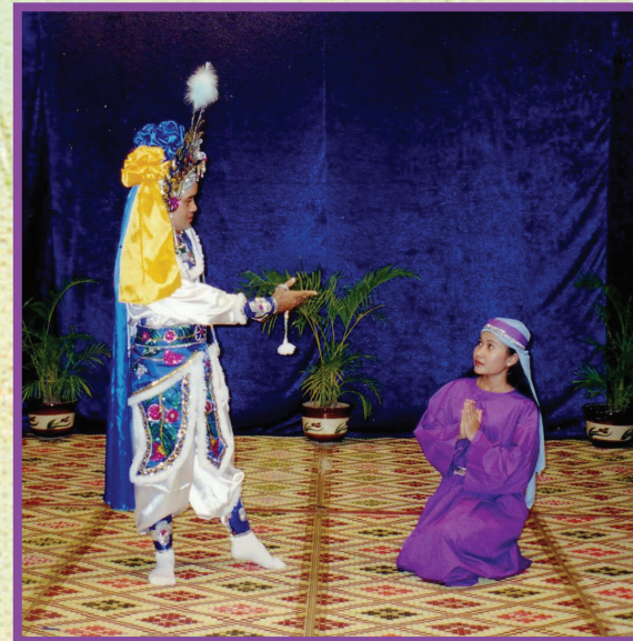
The Angel Gabriel and the Virgin Mary

"We have become all things to all people, that we may by all means save some." 1 Corinthians 9:22